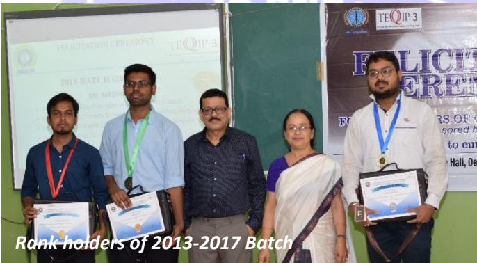
Rank holders of 2013-2017 Batch