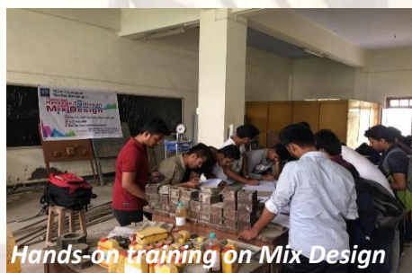
Hands-on training on Mix Design