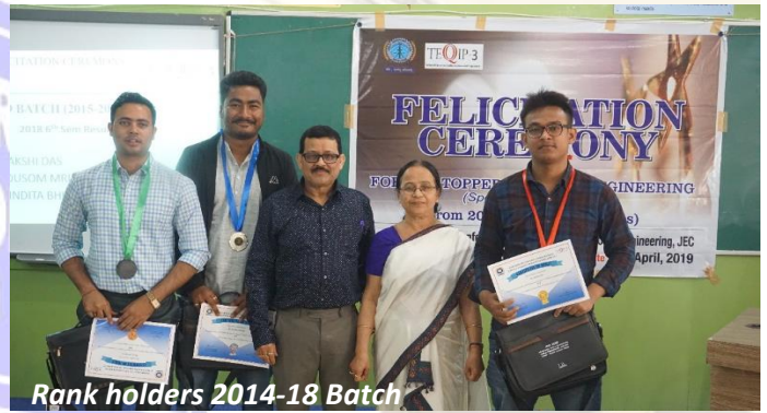
Rank holders 2014-18 Batch