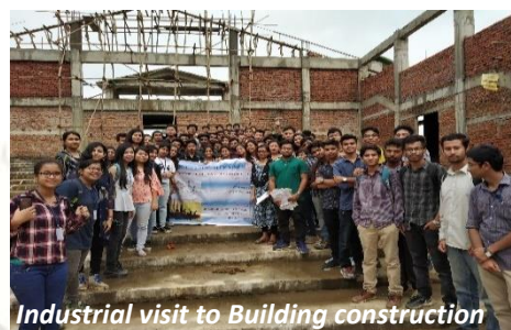
Industrial visit to Building construction