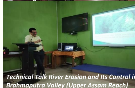
Technical Talk River Erosion and Its Control in Brahmaputra Valley (Upper Assam Reach)