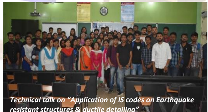
Technical talk on "Application of IS codes on Earthquake resistant structures & ductile detailing"