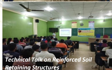
Technical Talk on Reinforced Soil Retaining Structures