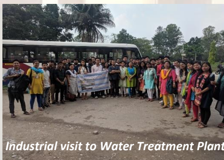
Industrial visit to Water Treatment Plant