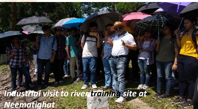
Industrial visit to river training site at Neematighat