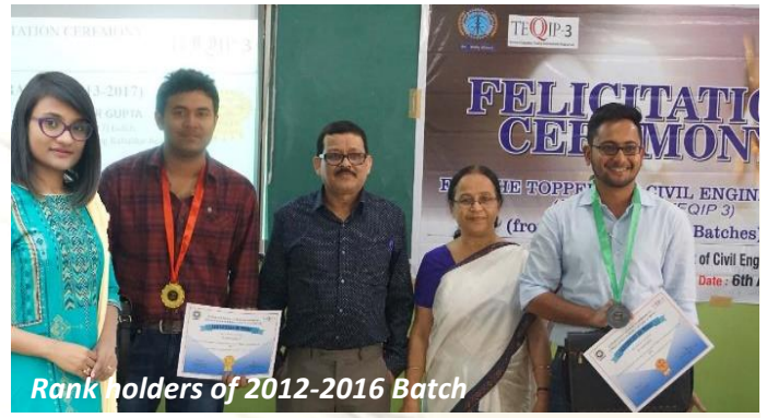
Rank holders of 2012-2016 Batch