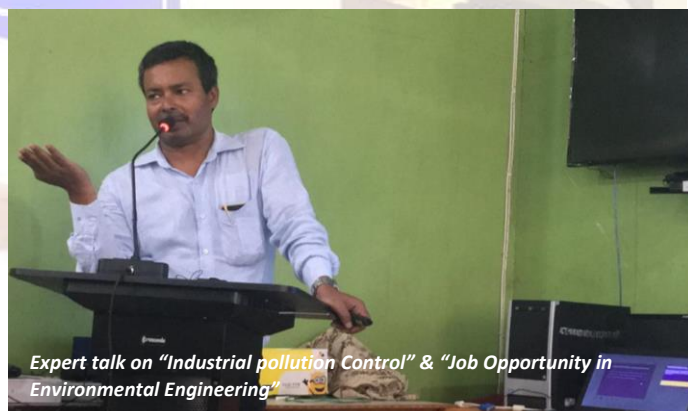
Expert talk on "Industrial pollution Control" & "Job Opportunity in Environmental Engineering"