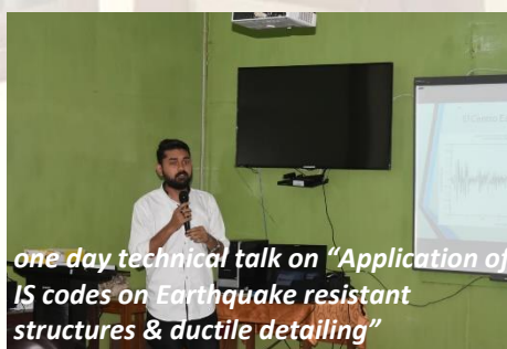
one day technical talk on “Application of IS codes on Earthquake resistant structures & ductile detailing”