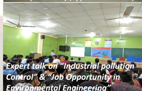
Expert talk on “Industrial pollution Control” &amp; “Job Opportunity in Environmental Engineering”