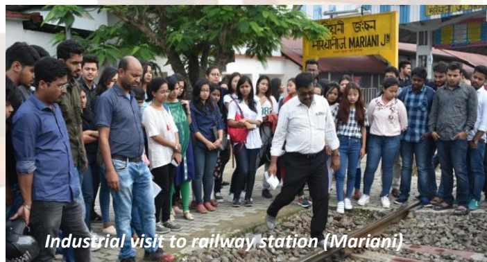
Industrial visit to railway station (Mariani)