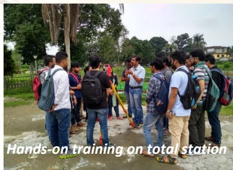
Hands-on training on total station