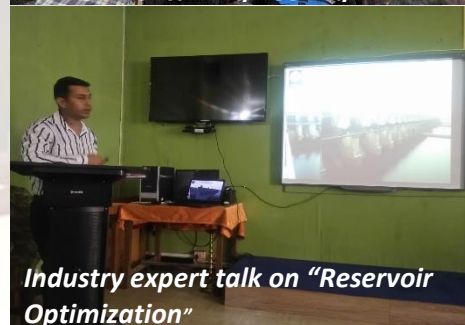
Industry expert talk on “Reservoir Optimization”