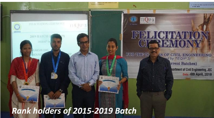
Rank holders of 2015-2019 Batch