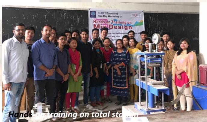
Hands-on training on total station