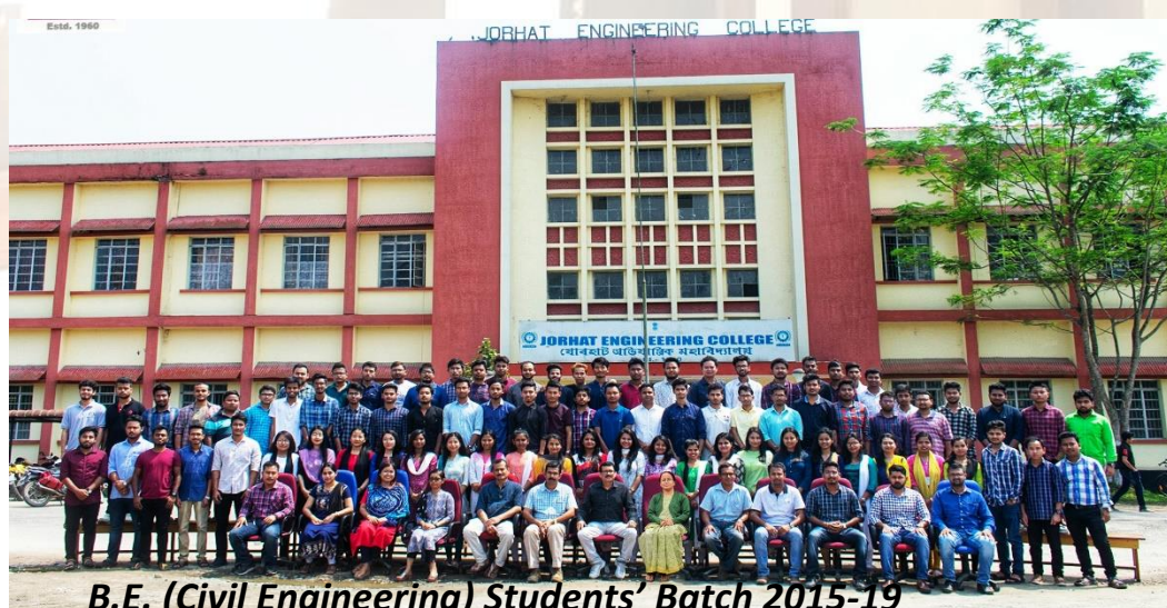
B.E. (Civil Engineering) Students' Batch 2015-19