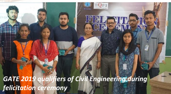
GATE 2019 qualifiers of Civil Engineering during felicitation ceremony