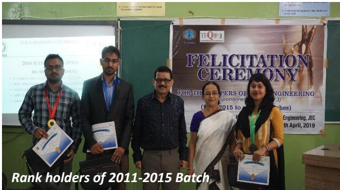
Rank holders of 2011-2015 Batch