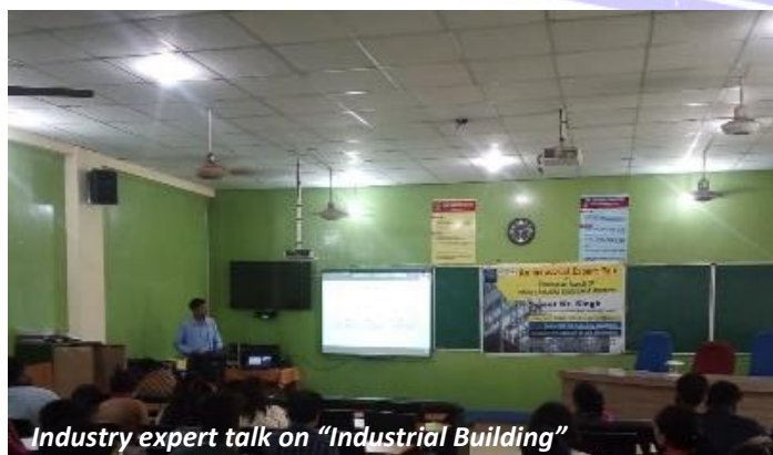
Industry expert talk on "Industrial Building"