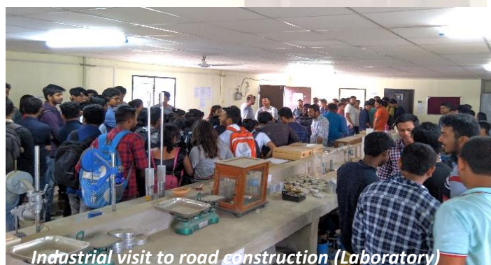
Industrial visit to road construction (Laboratory)