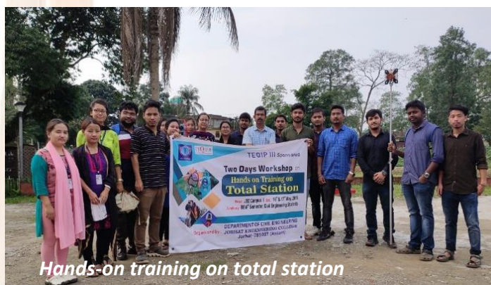
Hands-on training on total station