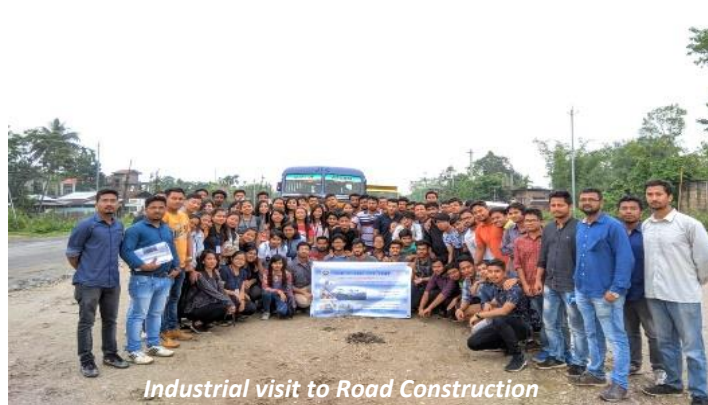
Industrial visit to Road Construction