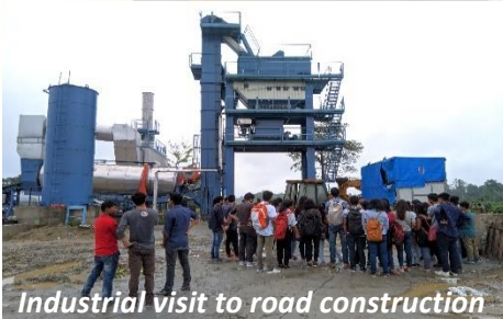
Industrial visit to road construction