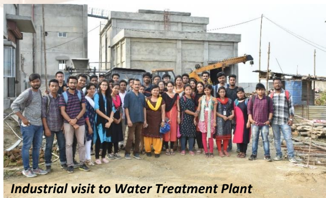
Industrial visit to Water Treatment Plant