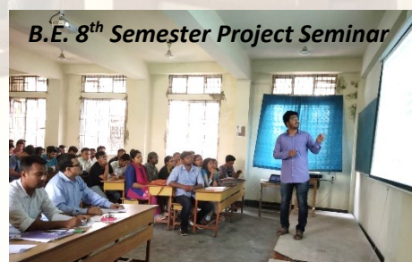
B.E. 8 th Semester Project Seminar