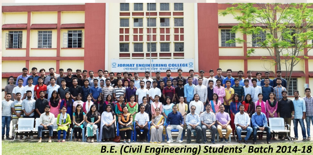
B.E. (Civil Engineering) Students' Batch 2014-18