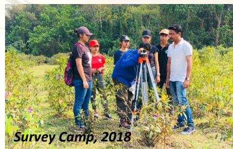
Survey Camp, 2018