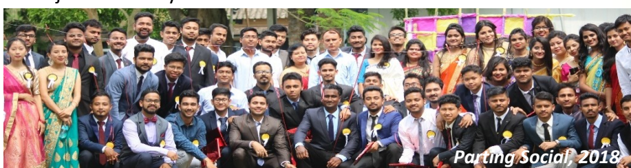
Parting Social, 2018