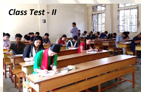
Class Test - II