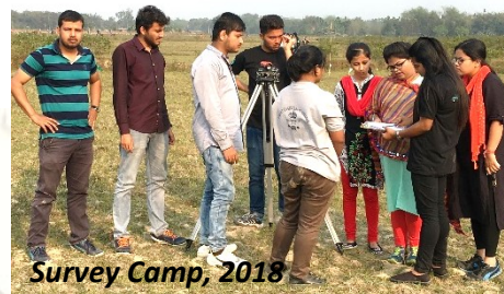
Survey Camp, 2018