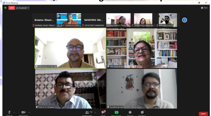
Fig: During Intra College Debate Competition