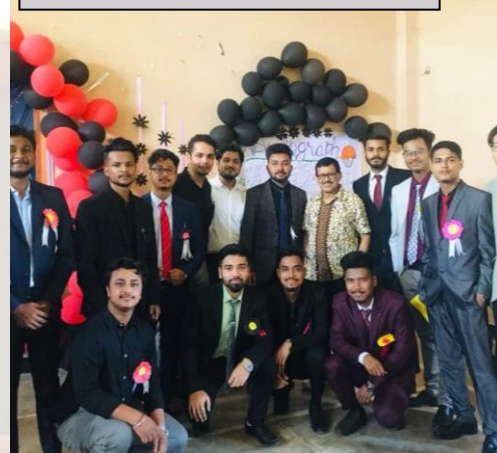
During Farewell Ceremony, 2022