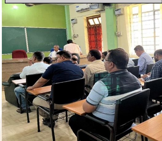
Alumni during Stake holders meeting