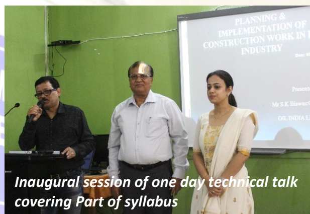
Inaugural session of one day technical talk covering Part of syllabus