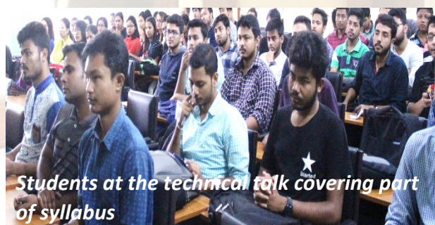
Students at the technical talk covering part of syllabus