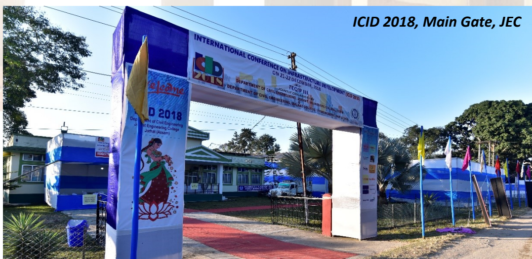
ICID 2018, Main Gate, JEC