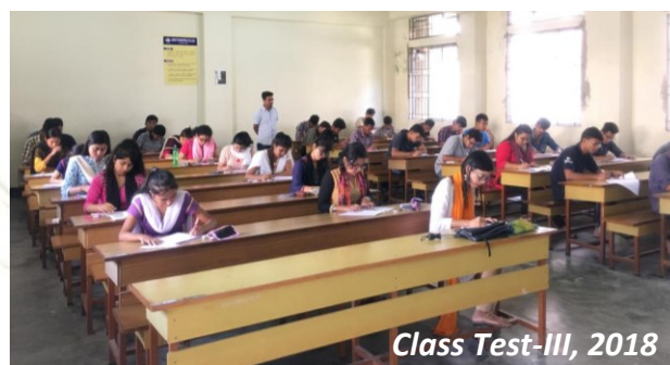
Class Test-III, 2018