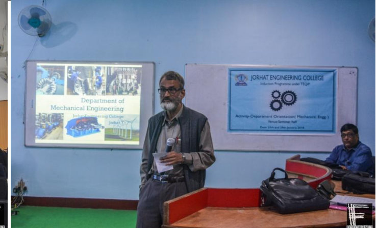
Orientation Program at Department