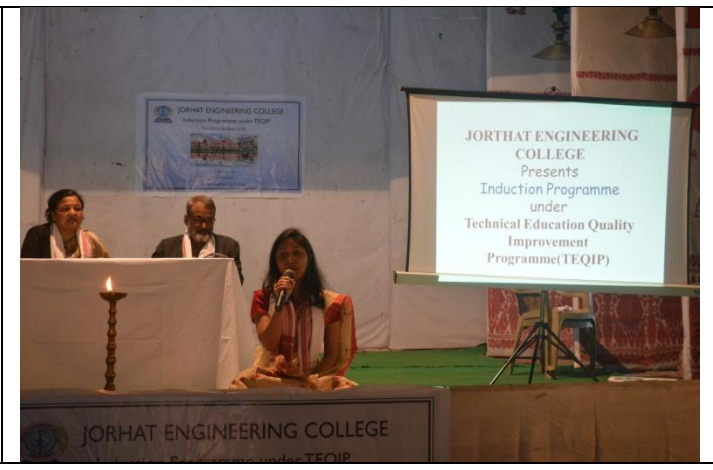
Inauguration of Induction Program