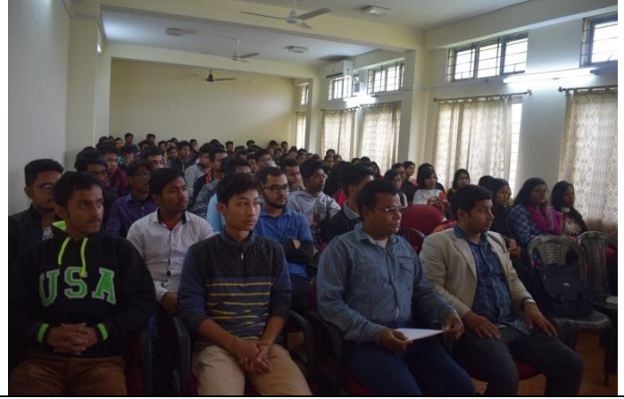
Workshop on Photography by Mr. D. Dutta