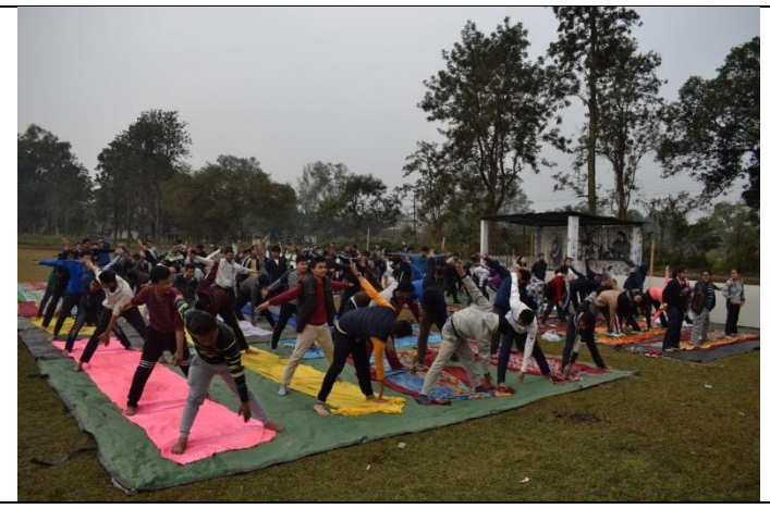
Physical Activity : Yoga