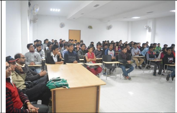
Technical session by Robotics Club, JEC