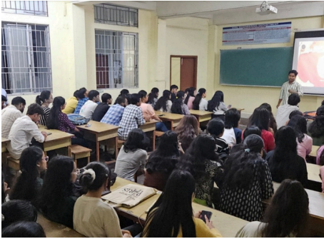
LITERARY SOCIETY ORIENTATION

The Literary Society also organized its Orientation program on 31st October i.e. Halloween Evening. A short film presentation was the highlight of the evening along with reading out of poems, stories and messages from "The Unsent Scroll". The Society later organized an online Slogan Writing Competition on the Occasion of National Education Day on 11th November, 2025 followed by a Tongue Twister Competition, the first of its kind, in remembrance and tribute to Dr. Banikanta Kakati on his Birth and Death Anniversary on 15th November, 2026.