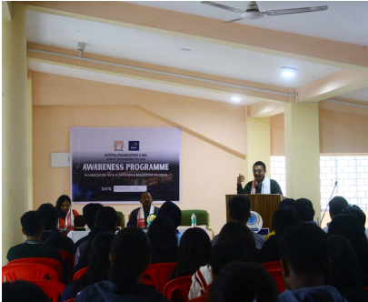
ASTITVA AWARENESS PROGRAMME