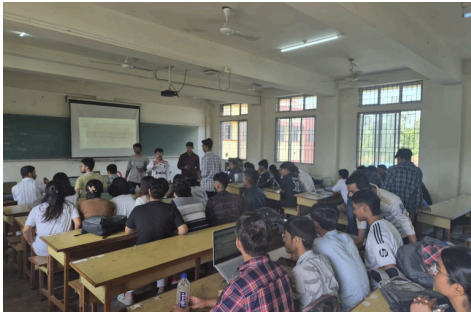
PCB DESIGN WORKSHOP

The Literary Society also organized its Orientation program on 31st October i.e. Halloween Evening. A short film presentation was the highlight of the evening along with reading out of poems, stories and messages from "The Unsent Scroll". The Society later organized an online Slogan Writing Competition on the Occasion of National Education Day on 11th November, 2025 followed by a Tongue Twister Competition, the first of its kind, in remembrance and tribute to Dr. Banikanta Kakati on his Birth and Death Anniversary on 15th November, 2026.