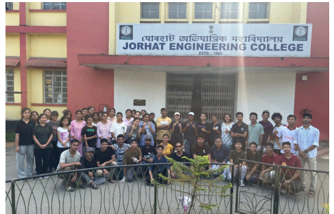
TEAM ASTITVA FOUNDATION

Jorhat-January 15, 2026: To exist is a fact of nature, but to matter is a work of heart. In the quiet corners of Assam, where marginalized often survive in the shadows, Astitva Foundation—whose very name means 'existence'—is proving that every life, whether it speaks in words or whimpers, deserves to be seen, heard, and protected. Established in 2025, Astitva Foundation has rapidly emerged as a transformative force for humanity in Assam. It is more than just an organization; it is a movement.